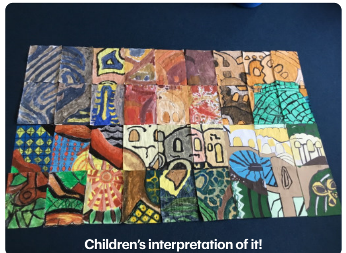
Children's interpretation of it!