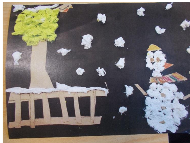
A picture made from one toilet roll!