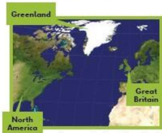
A map showing Greenland

In the summer months, the sun never sets; it is light all through the night.