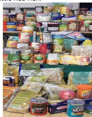
Collection of Harvest Produce for Jimmy's Night Shelter.

Thank you to everyone who has made a donation to the Harvest collection for Jimmy's Night Shelter in Cambridge. As you can see we amassed an impressive collection of produce which is greatly appreciated by all involved with Jimmy's. It was also a pleasure to welcome new parents to the school for the special Harvest Assembly. We were treated to some fantastic Harvest Songs from each of the phases, and the Reception children did a magnificent job of performing the story of 'The Little Red Hen.'